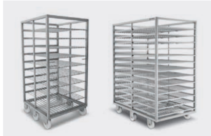
Sausage trolley Round profile

We manufacture all sausage trollies according to your wishes!