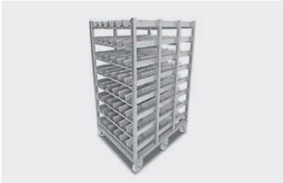
Sausage trolley Half shelly form